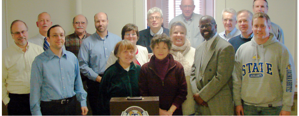
Members of new Quad Cities advanced club are pictured with visiting Crossroads Storytellers